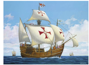
The Santa María Our Council Newsletter