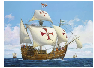
The Santa María Our Council Newsletter